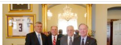
Prior to these events, the visiting MPs joined many diplomatic dignitaries, including EU MEP Tonino Picula (S&D), at an elegant Embassy party