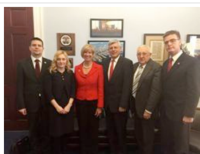
National Federation of Croatian Americans (NFCA) Provides Liaison for Visits to Washington by Croatian Members of Parliament Attending the President's National Prayer Breakfast

Washington, DC - During the first week of February, an