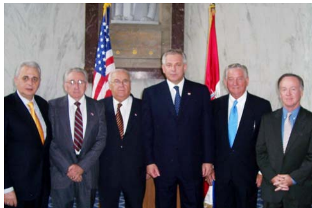
NFCA Leaders with Croatian Prime Minister Sanader, Minister Bozo Biskupic (Culture), and Ambassador Neven Jurica