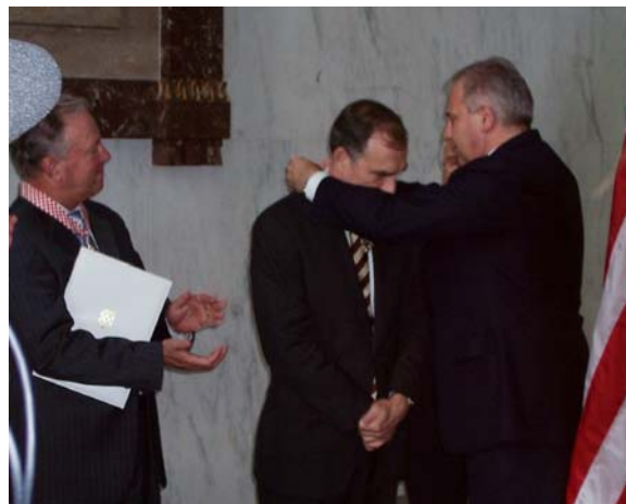
Prime Minister Sanader bestowing the Order of Duke Branimir with Ribbon on Congressman Visclosky