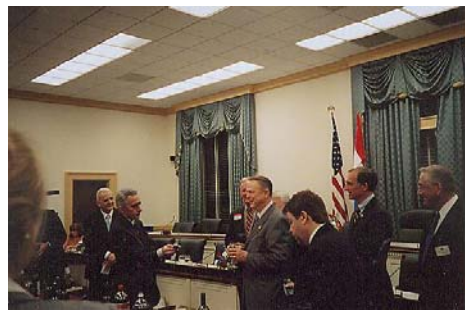
Congressman Rohrabacher at the caucus launch

Again, it has been a pleasure to represent the NFCA here in Washington. I am proud of our continued accomplishments with the US Congress and Executive Branch.