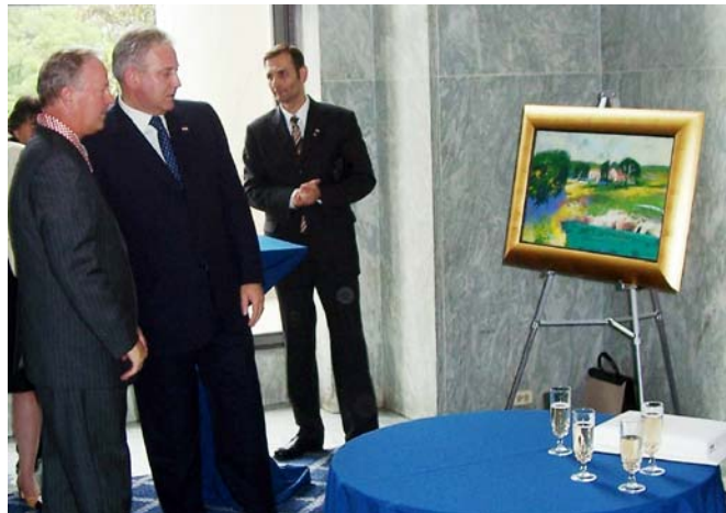
Prime Minister Sanader presenting a Croatian painting to Congressman Radanovich

Mr. Andrus’ letter to Ambassador Jurica also suggested that the Croatian government consider reforms to the present allocation of Diaspora representatives in the Croatian Sabor or Parliament. The letter noted that “the current system of consolidating the votes of Croatian citizens living in Western Europe, North America, Australia, and elsewhere with those living in Bosnia and Herzegovina effectively leaves those Croatian citizens living outside of Croatia and Bosnia and Herzegovina with no representation in the Sabor. The large number of Croats in Bosnia and Herzegovina far outweighs the potential numbers of voters in other countries. We fully support the rights of Croatian citizens in Bosnia and Herzegovina to continue to vote for their own representatives to the Sabor; but if Croatia seeks to draw to itself the political, intellectual, economic, and social potential of its Diaspora living abroad, it must make provisions for representation of their interests and concerns in the Sabor as well.”